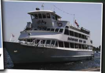
1,000 Islands Boat Cruise